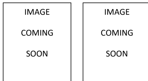
Figure 2: IMAGE COMING SOON will be extracted from the above image using OCR Technique